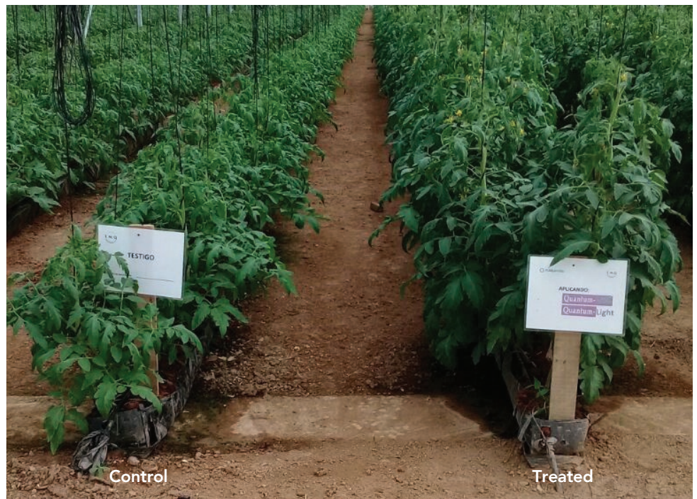
The photo above was taken on 7/17/18 during a greenhouse tomato trial in Rancho Arriba, Dominican Republic. The plants treated with Quantum Growth (right) are visibly larger with numerous flowers compared to the control plants (left).

For more information visit GrowQuantum.com or call 866.871.0154.